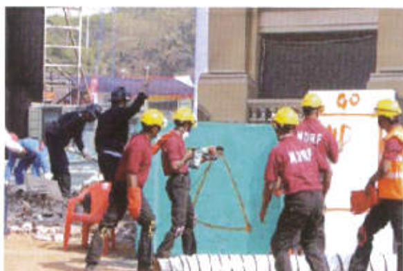
NDRF personnel demonstrating rescue skills during Tatpar 2010

8.33 NDRF Bn Pune participated in the two day Mega-Exhibition on disaster management "TATPAR 2010" organized by Disaster Management Department of Municipal Corporation of Greater Mumbai (MCGM) at Shivaji Park, Mumbai on Feb 26-27, 2010. The team also organized mock drills on earthquake disaster & dirty bomb explosion to generate awareness among the public. About 50,000 people visited the two day exhibition.