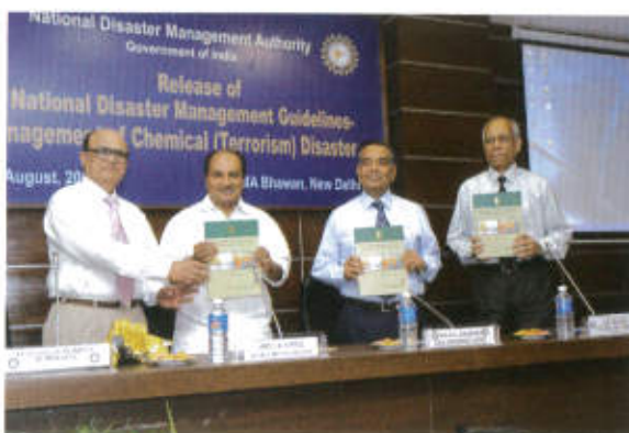
Release of Chemical (Terrorism) Disaster Management Guidelines by Shri A K Antony, Union Defence Minister on 04 August 2009

4.22 Shri A K Antony, Union Defence Minister, released these guidelines on 04 August 2009. These guidelines focus on all aspects of disaster management cycle including preventive measures, such as surveillance and intelligence, mitigation of direct and indirect risks, preparedness in terms of capacity development of human resources and infrastructure development as well as relief, rehabilitation and reconstruction. The guidelines lay emphasis on security and surveillance measures for installations,