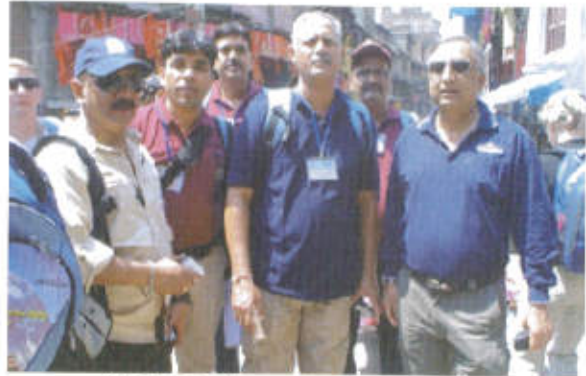
INSARAG training at Kathmandu, Nepal

Kathmandu, Nepal during April 21-24, 2009. The purpose of the exercise was to develop international coordination methodology in accordance with the INSARAG Guidelines, with a focus on cooperation between national and international disaster management authorities and response actors.