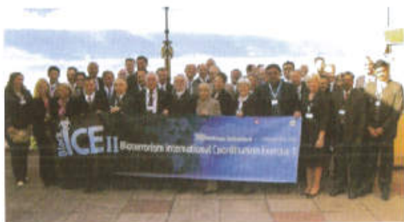
Participants at Montreux, Switzerland