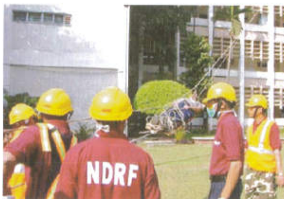
High Rise Building Rescue by NDRF personnel at IIT Mumbai

8.28 NDRF Bn Pune put up an International standard exhibition displaying disaster response equipments and organized