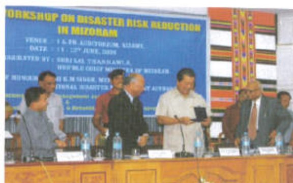
Shri LalThanhawla Hon'ble Chief Minister, Mizoram with Shri P.P. Srivastava, Member NEC and Shri K.M. Singh, Member NDMA at the inaugural function

8.26 NDMA, in collaboration with the North Eastern Council and Government of Mizoram, organized a two day workshop on Disaster Risk Reduction at Aizawl on June 11-12, 2009. The workshop was inaugurated by Hon'ble Chief Minister of Mizoram Shri Pu Lal Thanhawla and attended by MLAs, senior