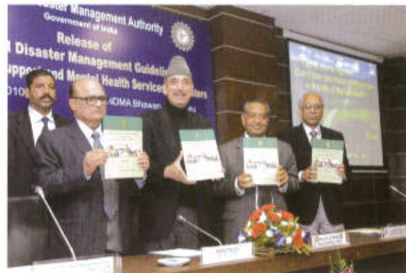
Release of Psycho-Social Support and Mental Health Services Guidelines by Shri Ghulam Nabi Azad, Union Health Minister on 20 January 2010

4.24 Disasters leave a trail of agony which significantly impact the survivor's mental health resulting in social disability and affecting their overall well being. Psycho-Social Support and Mental Health Services have an important role to play, to cope up with the challenges in the recovery. These interventions help individuals, families and groups to build human capacities, restore social cohesion, dignity and cultural integrity. Unfortunately, this facet also tends to be generally ignored while handling any disasters. Consequently, the formulation of the national guidelines on the entire gamut of Psycho-Social Support and Mental Health Services has been one of the areas of concern of the NDMA with a view to build resilience to respond effectively in all types of disasters. The guidelines on the subject were prepared