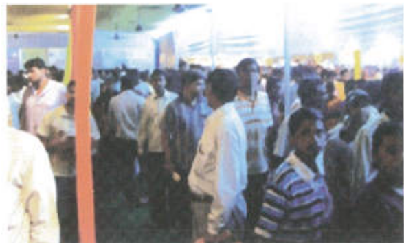
NDRF Stall surrounded by pool of interested visitors at Gandhi Maidan, Patna

8.30 The State Government of Bihar organized a major event on the occasion of 'Bihar Divas' at Gandhi Maidan, Patna during the period March 22-24, 2010. The programme was inaugurated by Shri Nitish Kumar, Hon'ble Chief Minister of Bihar. All the ministries/ departments of the State Government participated in the programme.