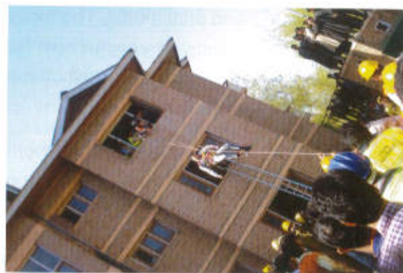
Mock Exercise Earthquake, Anantnag, 16 March

framework, constitution of School Disaster Management Committee, outline DM Plan, framing of DM teams and process of conduct of mock exercises are delineated. In Step 2, mock exercises on perceived disaster are conducted in the schools by actual evacuation, search & rescue, first aid, etc. being practiced. The mock exercise is controlled from school control room established near the Principal's office. The details of mock exercises in schools are given in table below: