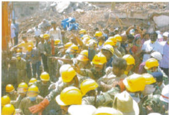
NDRF clearing debris of collapsed building at Bellary, Karnataka

8.20 On the requisition of SDMA Karnataka, two specialist search and rescue teams (100 personnel) of NDRF Bn Pune along with State-of-the-art search and rescue equipments airlifted on Jan 27, 2010 and reached the site of collapsed five storey under construction multistoried building at Bellary Karnataka. The colossal search and rescue efforts of NDRF saved 20 precious human lives and recovered 27 dead bodies. The team also rescued a live victim from the debris after 09 days.