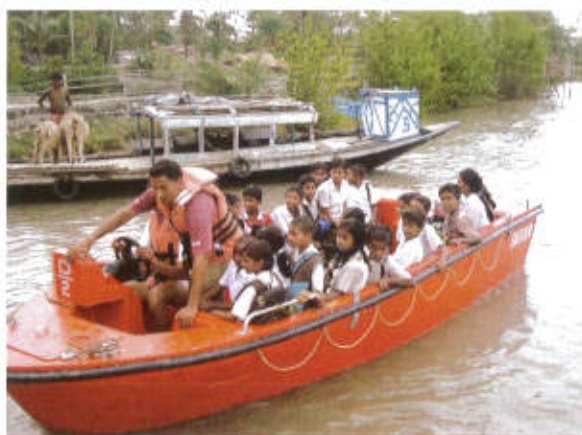
NDRF shifting school children during Cyclone

8.12 Cyclone Aila hit the coast of West Bengal on May 25, 2009 with a wind speed of 100-110 kms per hour and storm surge with high waves (25 feet). NDRF promptly responded to the call of Government of West Bengal and 14 teams (600 personnel) of NDRF Bns Kolkata and Mundali along with 84 boats, life buoys, life-jackets, fishing nets, relief materials and medicines were deployed in the affected areas of districts 24 Pargana North and South for rescue and relief operations. During the operation NDRF personnel rescued