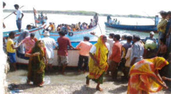
Mock Exercise Cyclone, Porbander, 19 June 2009

5.23 During the year under report, a total of 39 mock exercises were conducted throughout the country on various disasters like Urban Fire, Chemical (Industrial) Disasters, Floods, Earthquakes and Cyclones. The highlight of the mock exercise during this year was the conduct of mock exercise for Terrorist Attack and Gas Leak in Delhi Metro Rail.