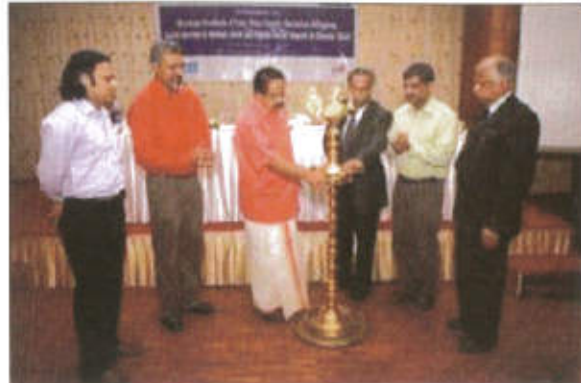
Shri N. Vinod Chandra Menon (Hon'ble Member, NDMA) and Shri KP Rajendran, (Revenue Minister, Govt. of Kerala) inaugurating the conference on Minimum Standards at Thiruvananthapuram, Kerala on 9th Feb, 2010.

4.41 National Disaster Management Authority in collaboration with Sphere, Kerala State Disaster Management Authority, ESAF and UNICEF organized a conference on Minimum Standards for Food, Water Supply, Sanitation & Hygiene, Health Services & Medical Cover and Psycho-Social Support in Disaster Relief, at Residency Tower, Trivandrum. The two day conference was