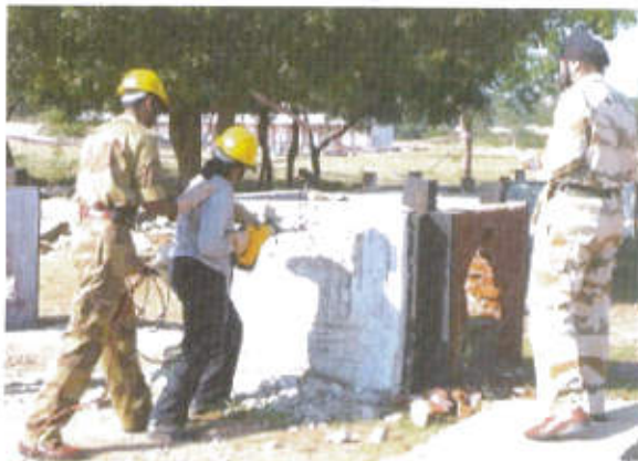
Training by Swiss experts at BTC Bhanu

8.8 Under Indo-Swiss Collaboration for Training 24 NDRF personnel attended the Rescue (USAR) training organized at National Industrial Security Academy, Hyderabad in Dec, 2009. Canine search training was also organized at BTC Bhanu in which 29 trainers along with their dogs participated during the period March 30-April 12, 2009, Nov 24-Dec 02, 2009 and March 15-26, 2010.