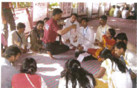
NDRF personnel training the volunteers of Art of Living Foundation at Bangalore

techniques and skills like high-rise building rescue, flood water rescue, protection and action during NBC emergencies, MFR & CSSR techniques.