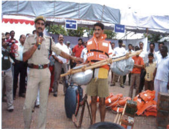
Mock Exercise Floods - Chhattisgarh, 29 June 2009

stakeholders. In the next phase, the Table Top Exercise is carried out to elicit the responses of the participants in simulated scenarios. These scenarios are painted to cover the entire gamut of the disaster management cycle. At the end of this phase, the lessons that emerged are shared with all the participants and sufficient time is given for the participants to hone their responses and train their subordinates before the actual conduct of the mock exercise. The exercise is conducted on a simulated scenario and is progressed keeping in view the responses of the various participants. A number of observers are also detailed to monitor the exercise and apart from the participants, the spectator from the community and stakeholders are also invited to attend the mock exercise. After the mock exercise a detailed debriefing is carried out in which the observers are asked to give their feedback. The gaps identified during these exercises are communicated to the State and District Administration and also to the Management of various industries.