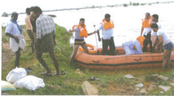
NDRF Team rescuing people during Floods in Karnataka

districts of Karnataka (Bagalkote, Raichur, Gadag and Bijapur).