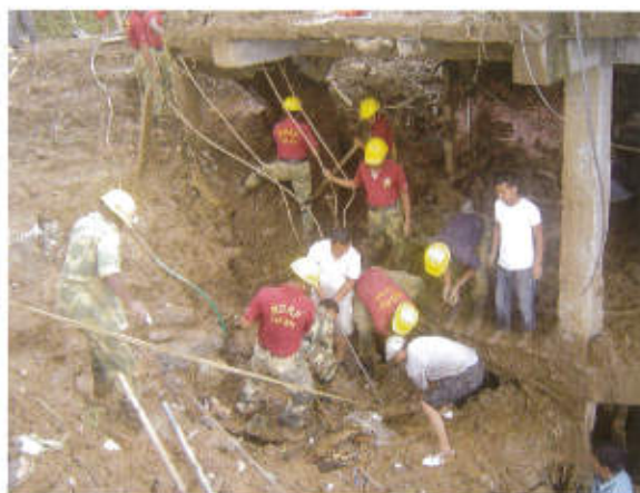
NDRF Team clearing debris after Landslides in Darjeeling

8.13 Following a heavy landslide in Darjeeling hills several houses were damaged at various places across three hill sub-divisions due to incessant rain on the