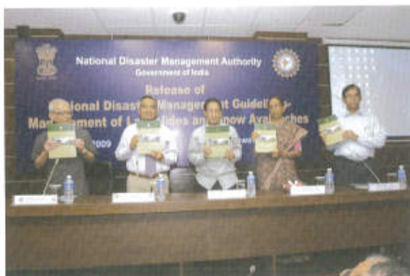
Release of Landslides & Snow Avalanches Management Guidelines by Shri B K Handique, Union Minister of Mines, in New Delhi on 23 June 2009