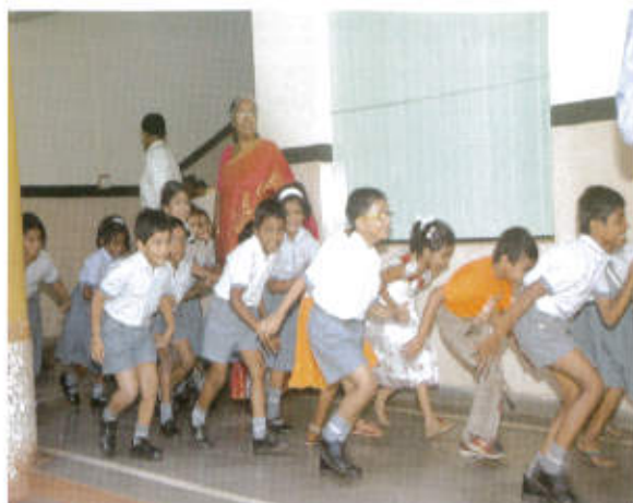
Mock Exercise on School Safety, Bellary, Karnataka, 17 June 2009