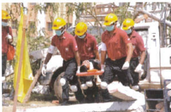
NDRF personnel showing their rescue skills at Technika 2010

8.29 NDRF Bn Kolkata participated in "Technika 2010", the annual technical festival of Birla Institute of Technology, Mesra. The exhibition was inaugurated by H. E. the Governor of Bihar Shri Devanand Konwar on March 26, 2010. NDRF Bn Kolkata put up an exhibition of international standard showing their State-of-the-art rescue equipments to generate awareness. NDRF personnel demonstrated the skills of Heli-Rescue, Collapsed Structure Search & Rescue, High-Rise Building Rescue to generate disaster awareness among the visitors. Shri Devesh Chandra Thakur, Hon'ble Minister of Disaster Management, Govt of Bihar also witnessed