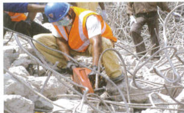
NDRF Personnel clearing metallic debris at BALCO, Korba

8.16 On Sept 23, 2009 an under-construction chimney (100 meter high) collapsed at the site of BALCO's proposed power plant in Korba. On request of State Government 03 teams (121 personnel) of NDRF Bn Mundali reached the spot by road on Sept 25, 2009 and started search and rescue operations. NDRF personnel retrieved 42 dead bodies by cutting metal pieces of the chimney and clearing debris.