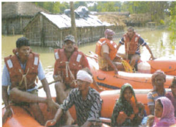
NDRF Personnel rescuing flood marooned villagers in Bihar

8.14 On August 01, 2009 a wide breach (60 meters) in the main embankment of river Bagmati flooded 11 Panchayats of Runnisaipur block in Sitamarhi district of Bihar. Seven teams (235 personnel) of NDRF Bn Kolkata along with 53 boats and other flood rescue equipments carried out rescue and relief operations in the flood affected areas. NDRF personnel rescued 1,034 trapped persons and distributed medicines to 831 flood victims.