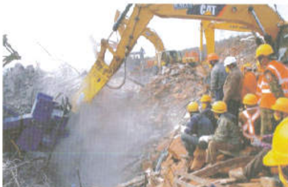
NDRF clearing debris of collapsed bridge at Kota, Rajasthan

8.19 On Dec 25, 2009, the under-construction bridge over Chambal river in Kota